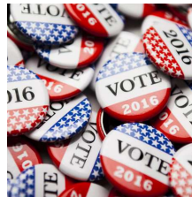
LOOKING AHEAD TO THE GENERAL ELECTION