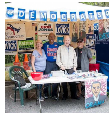
OUR CANDIDATES AND ENDORSED INITIATIVES

After a hiatus our monthly newsletter has returned. We are working to provide you with an informative monthly circular, built collaboratively within our District. There will be many opportunities for all to get involved from suggesting article ideas, to guest writing and picture submissions. It is our goal to provide concise and timely communication to compliment the 44th LD Democrats objectives. We hope you enjoy this "Welcome back" issue!